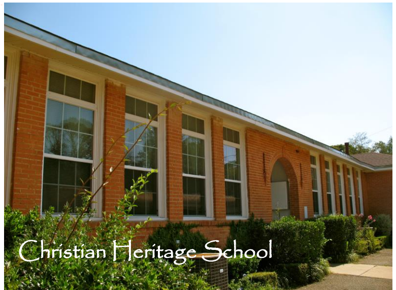
Christian Heritage School

Discipling the Nations through Education